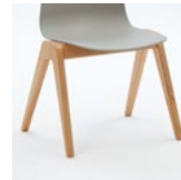
Solid Oak base