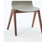
Solid Walnut base