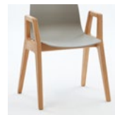
Solid Oak base