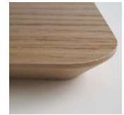
Oak Veneer with reverse chamfer, polished MDF edge