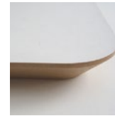
White MF MDF with reverse chamfer, polished MDF edge