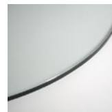
UV bonded clear glass polished edges