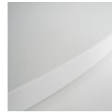
MF MDF White edge banded