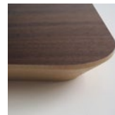
Walnut Veneer with reverse chamfer, polished MDF edge