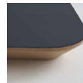
Forbo Lino with reverse chamfer edge 8 colours available