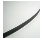
Compact laminate white, with black crescent edge