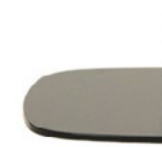
Black powder coated base and stem. Also available in naughtone RAL colour selection.