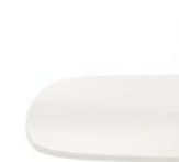
White powder coated base and stem. Also available in naughtone RAL colour selection.