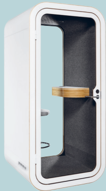
FRAMERY O is typically used for phone calls and concentration.

Open offices enable free-flowing ideas between employees. However, noise is a common problem. Almost 50 percent of employees in open offices say the lack of sound privacy is the most frustrating aspect in their workplace. Installing sound insulated high-quality privacy spaces in offices significantly increases satisfaction and efficiency in the workplace.