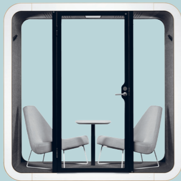
FRAMERY Q enables private meetings for 1-4 users.

Users should be able to walk to the booth in a few seconds when their phone rings, or to have a spontaneous discussion with a colleague.